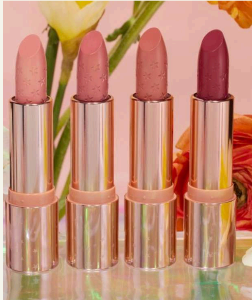
Colourpop Bloom On Lux Lipstick Set, £30