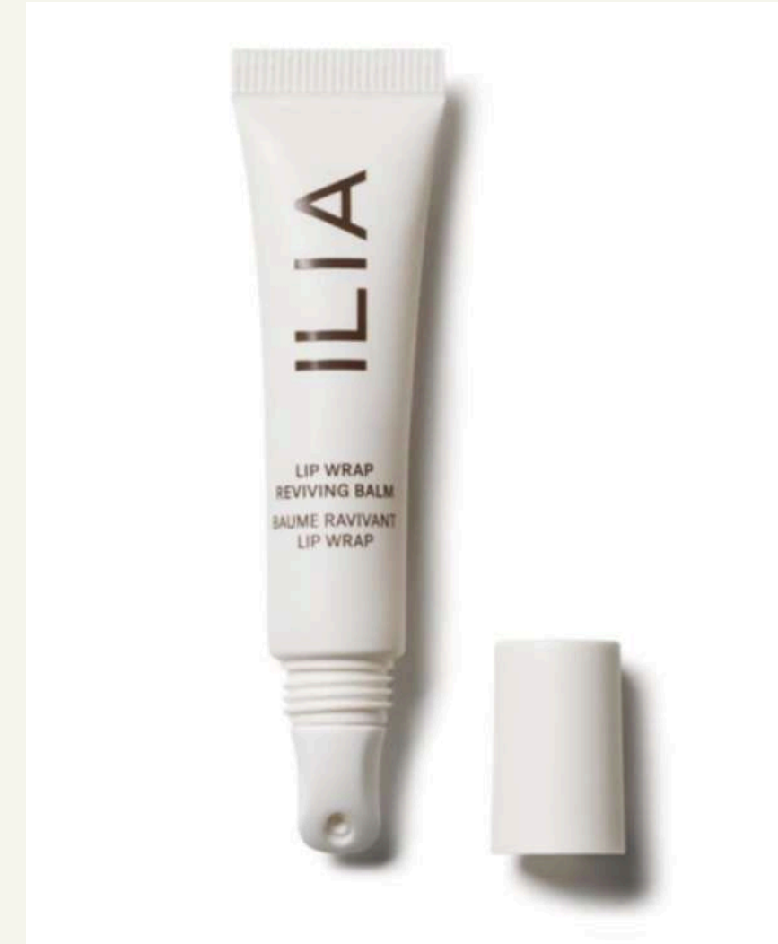
Ilia Lip Wrap Reviving Balm, Jan 2022, $24