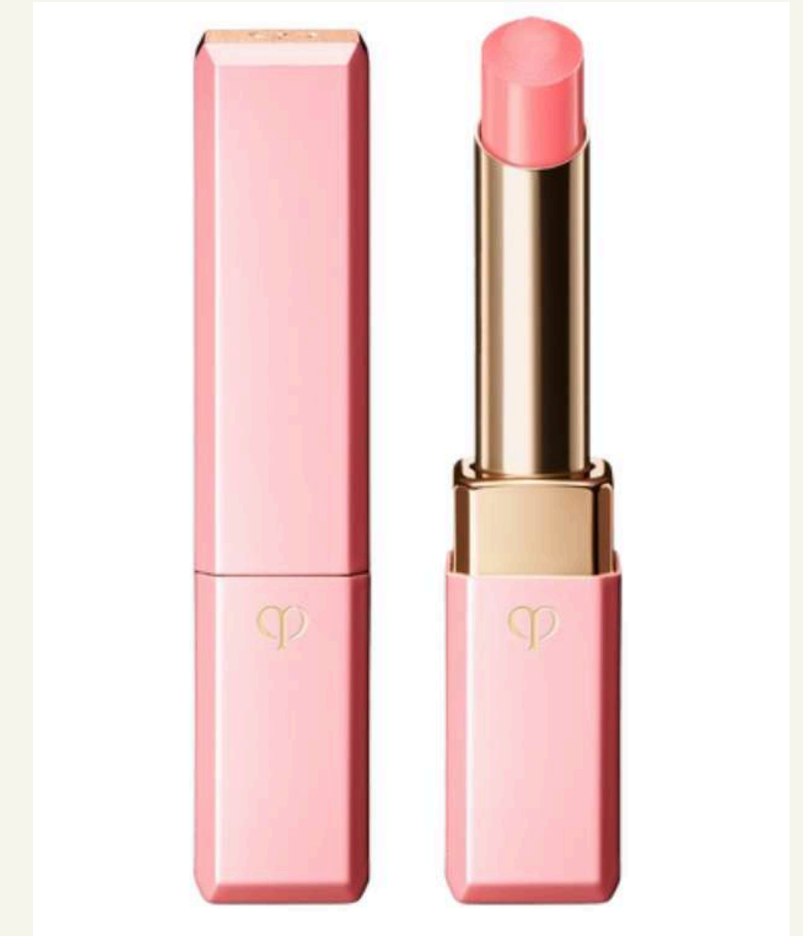
Cle de Peau Beauté Magnificateur Lèvres N Lip Glorifier, June 2022