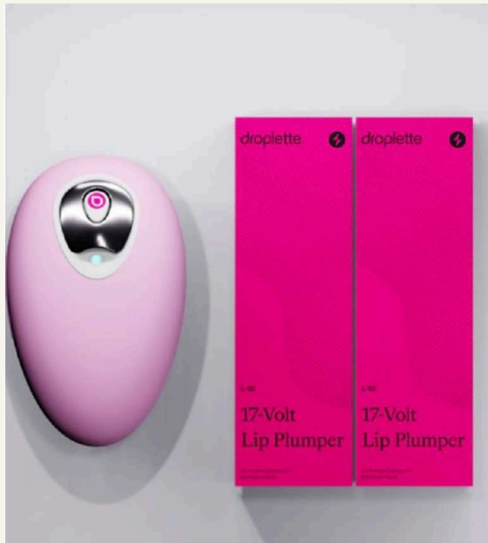
Droplette 17-Volt Lip Plumper Set, $299