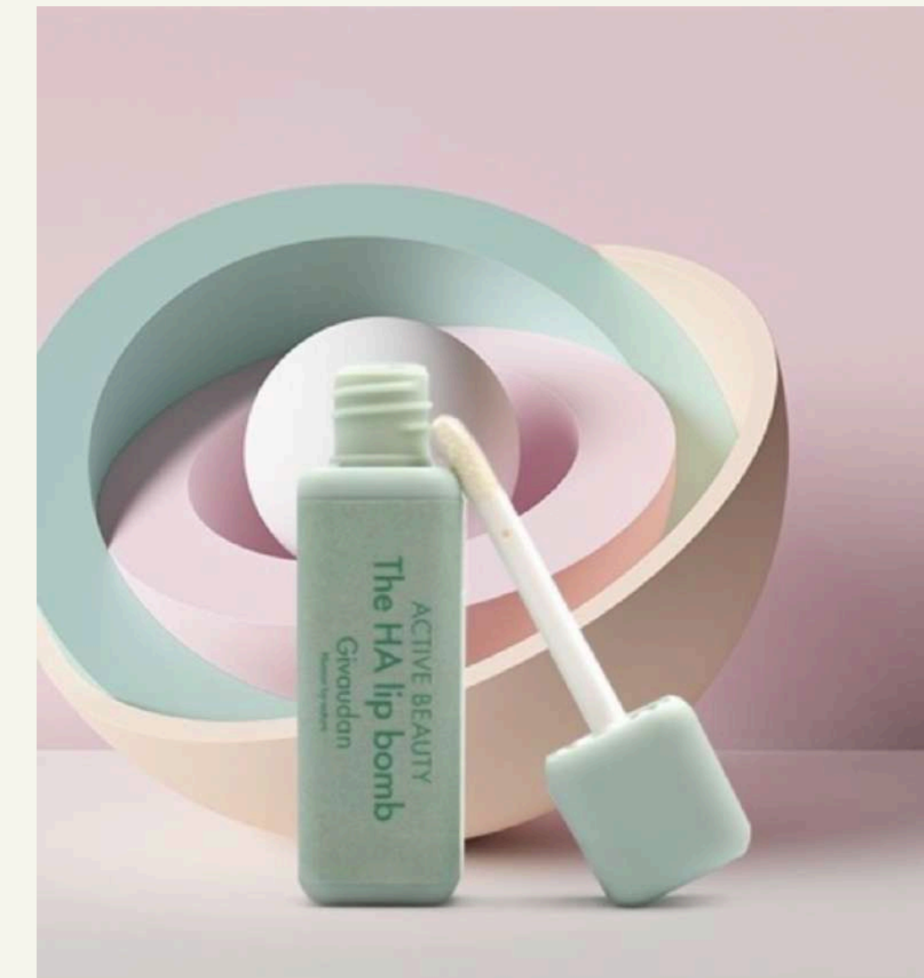
Givaudan Spherulite, July 22