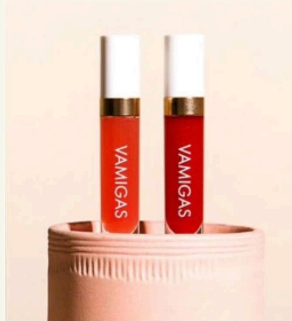
Rosa Mosqueta Infused Lip Oil, $18 May 2022